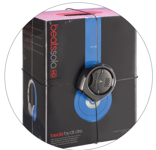
Auto-lock feature reduces number of steps required to apply