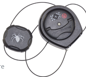
S3vx 2 Alarm Attack Spider Wrap